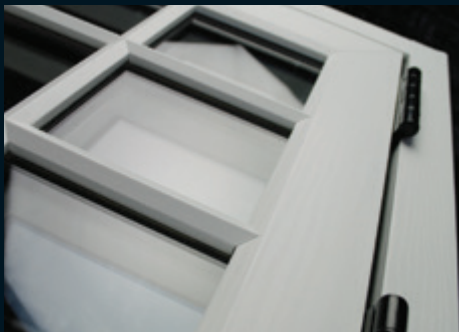
Dummy or functional butt hinges upgrade