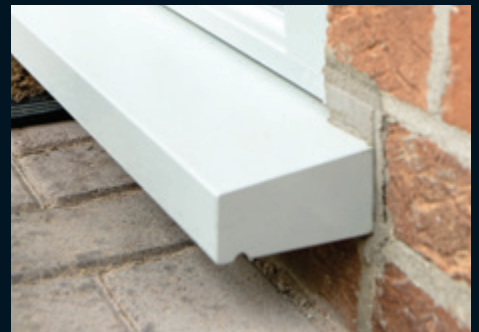
55mm Radlington cill option

Astragal Bar Grids supplied Fully Glazed