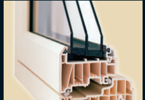
100mm outer frame for 28mm double glazing or 44mm triple glazing