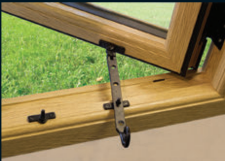
Dummy or functional stays upgrade