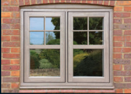
20mm Astragal and 60mm Transom bar upgrade