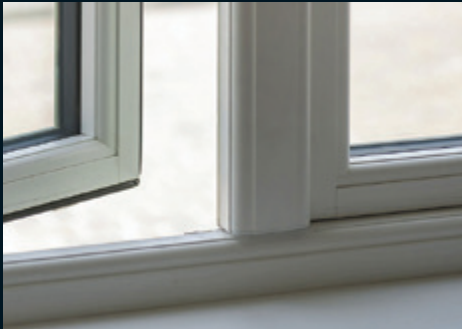
Residence9 has a traditional, decorative, internal finish