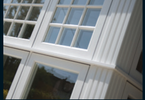
Flush external finishes with equal sightline and external transom bar upgrade